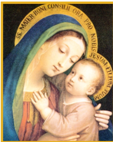
Our Lady of Good Counsel, our patroness, Pray for Us!