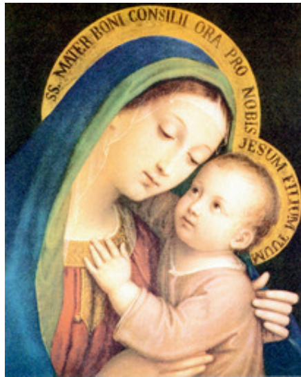
Our Lady of Good Counsel, our patroness