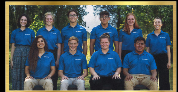
NET Team 5