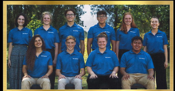
NET Team 5