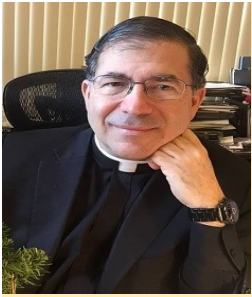
Fr. Frank Pavone