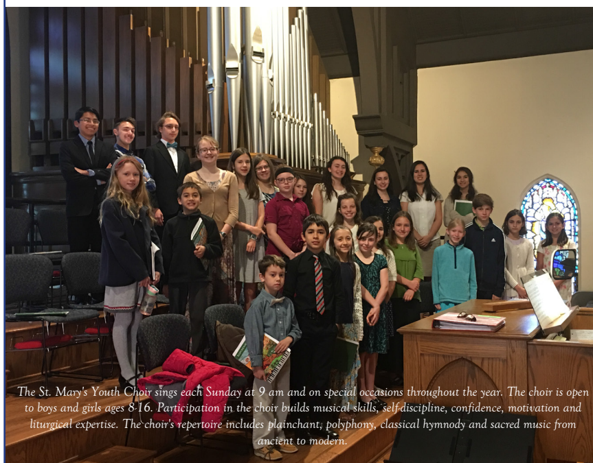
The St. Mary's Youth Choir sings each Sunday at 9 am and on special occasions throughout the year. The choir is open to boys and girls ages 8-16. Participation in the choir builds musical skills, self-discipline, confidence, motivation and liturgical expertise. The choir's repertoire includes plainchant, polyphony, classical hymnody and sacred music from ancient to modern.

For further information contact the Choirmaster: arlen.clarke@stmarysgvl.org