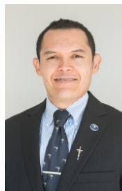
Friday 18 May 6.00 pm St Mary's Catholic Church Greenville, SC