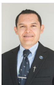
Friday 18 May 6.00 pm St Mary's Catholic Church Greenville, SC