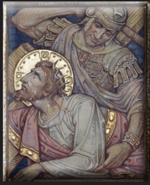
seventh station: jesus falls the second time