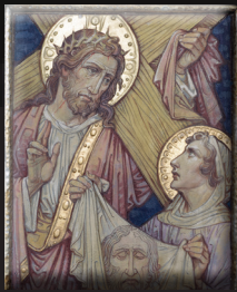
sixth station: veronica wipes the face of jesus