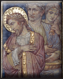
first station: jesus is condemned to death