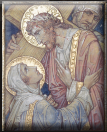
fourth station: jesus meets his blessed mother