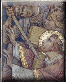
third station: jesus falls the first time