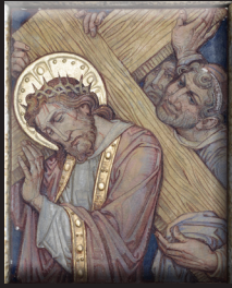
second station: jesus receives his cross