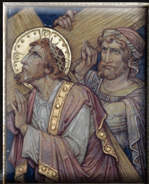
fifth station: simon of cyrene helps to carry the cross