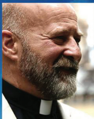
Fr. Dwight Longenecker Former Anglican Minister and Catholic Priest