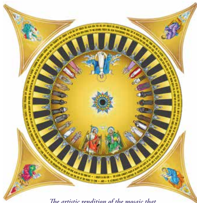
The artistic rendition of the mosaic that will adorn the Trinity Dome.

The Bishops of the United States approved a special one-time second collection for the Trinity Dome. Your prayerful and financial support will not only adorn this "Crowning Jewel" and complete Mary's Shrine, but will also leave a lasting legacy for generations to come in this living monument to our Catholic faith and heritage that is America's Catholic Church.