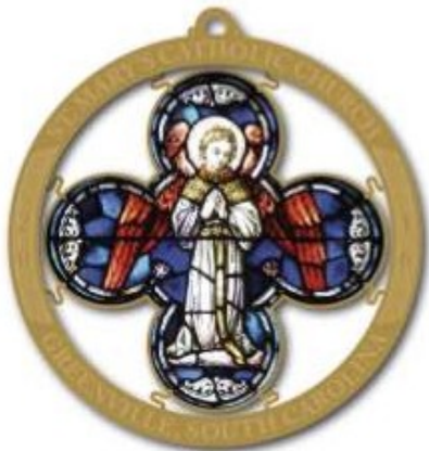
'St. Mary's Catholic Church, Greenville, South Carolina, 2016' encircles the ornament. Size: W-2.75" x H-2.93"

The image is from the Washington Street Window of the St. Mary's Choir loft. An angel is a pure spirit created by God.