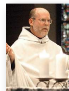
Chancellor Abbot Placid Solari