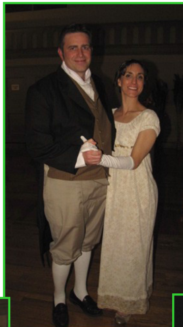
Mr. Darcy and Miss Elizabeth Bennet