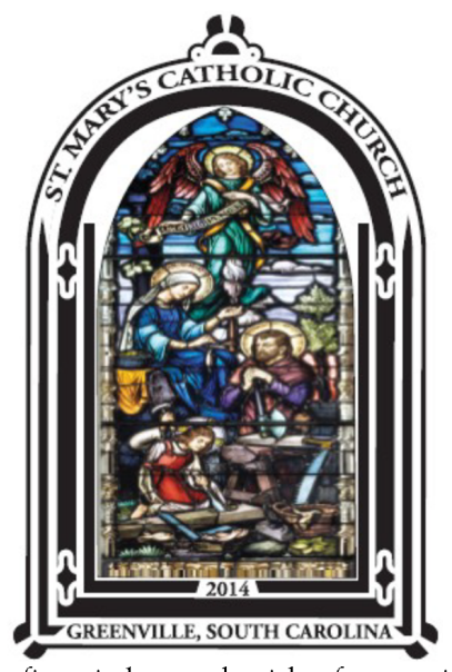
The first window on the right after entering the Church from Washington Street