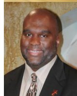
Deacon Harold Burke-Sivers Catholic Evangelist