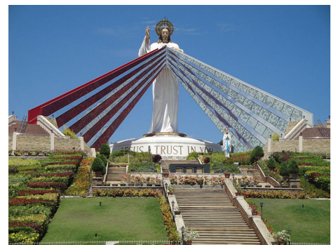
The 50-ft tall Divine Mercy Shrine at Divine Mercy Hills in the city of El Salvador, Misamis Oriental, Philippines.

The next training class at St. Mary's will be in the Monsignor Gwynn Room of Sacred Heart Hall on Tuesday 20 May at 6.00 pm. Registration must be done online at virtusonline.org ; click on "registration".